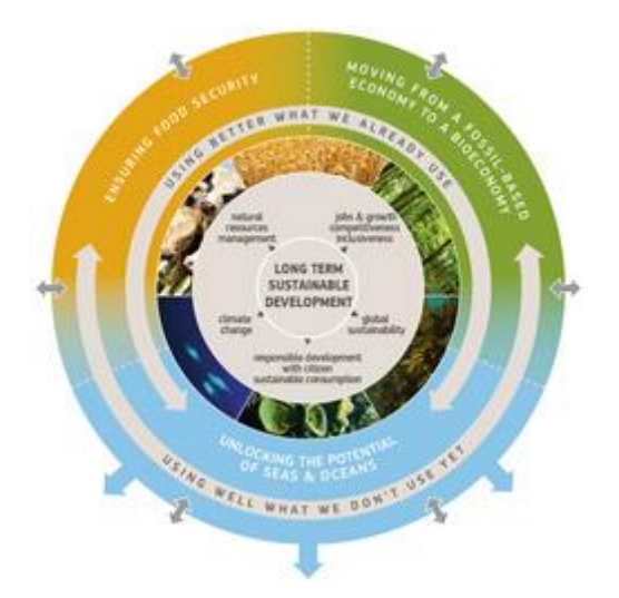
Figure depicting biobased economy: https://ec.europa.eu/research/bioeconomy/index.cfm?pg=policy